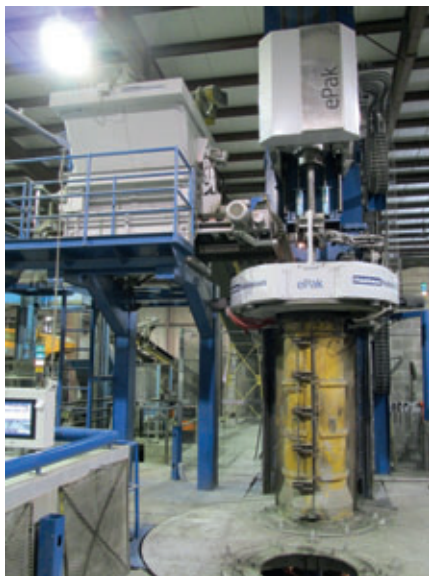
Figure 6: The new HawkeyePedershaab ePak packerhead pipe production system at Coastal Pipeline Products in Calverton, N.Y., is used to produce from 12 to 36 inch inside diameter dry cast pipe. The ePak system features a uniframe structure that eliminates the multiple support legs found on conventional systems, direct drive permanent magnetic motors provide gearless operation for greater torque and accuracy, and closed-loop PC-based controls.

Coastal was able to install the new system in its existing facility without major modifications to the building structure. In addition, the new system was able to use existing utilities such as air, water and the original system's 400-amp electrical service. "The first thing you notice when you walk into the plant and see the ePak (see figure 7) is the openness around the system and the turntable," Raymond observes. "That center leg that all other packerhead machines use that comes down in the center of the turntable is eliminated with the ePak. The open turntable makes it easier to set up and change forms, easier to maintain the system, and lets us optimize the space we have."