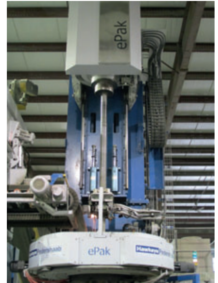
Figure 5: The eDrive system found in the ePak packerhead pipe production system from HawkeyePedershaab features two gearless permanent-magnet electric motors (top section in photo above) that provide direct control of the packerhead torque and speed and help reduce maintenance and energy use. Dry mix concrete is fed into the pipe form by a troughed conveyor through the Top Table Assembly (at bottom of photo).

both single direction and bi-directional tooling (e.g., bi-directional tooling for smaller pipe sizes and single direction tooling for larger sizes), is helping Coastal save money.