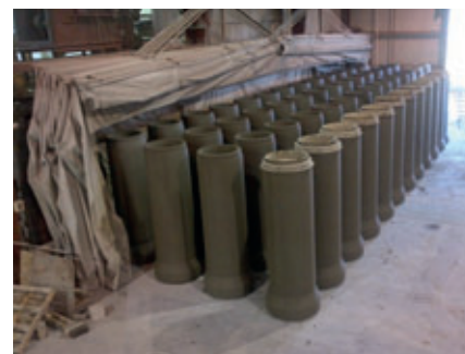
Figure 3: Here, 30-inch "green" pipe is placed in the curing area. A fabric curing tent will be deployed to control the curing process.