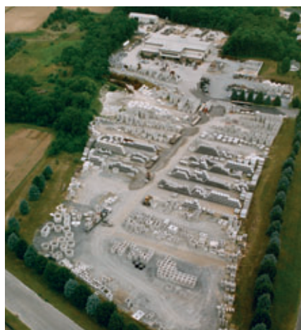
Figure 1: The 20-acre Coastal Pipeline Products facility features a 30,000 square foot main building housing all dry cast production as well as a portion of the wet cast operation. The majority of wet cast products are produced outside, except during inclement weather.

pany name—however it quickly realized that it needed to diversify its product catalog in order to compete in a highly competitive market, often against much larger firms. In addition to its original Hydrotile packerhead system, the firm also uses a Teksam vibratory pipe system to produce 42 to 72 inch pipe and a Prinzing vibratory system for dry cast manhole risers. "Our 'small' diameter pipe system was pretty worn out and it was starting to impact our quality, which is critical in our market. Every piece of pipe we make is inspected and certified. Nothing but the best is acceptable. Our in-plant rejection rate was rising and that was unacceptable."