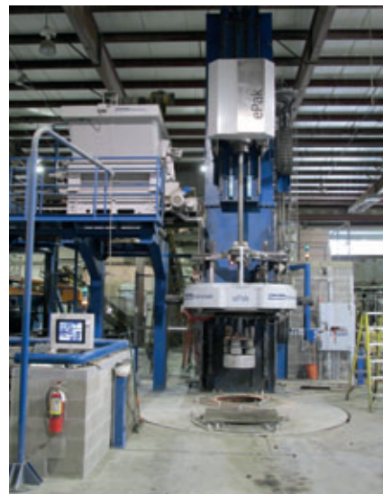
Figure 7: The uniframe ePak main tower eliminates the support legs found on most packerhead pipe production systems, allowing the use of a smaller turntable and free access to molds and other system components. At left, the ePak control PC is Windows based for intuitive operation of the entire pipe production cycle.

The new controls that came with the ePak system provides Raymond and his staff with far greater control over every aspect of pipe production. "I've always maintained that producing quality dry cast products takes the right technology and little bit of magic," Raymond says. "Where our old packerhead system was far more sensitive