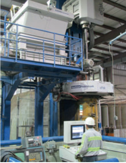
Figure 4: The HawkeyePedershaab ePak RCP production system at Coastal Pipeline Products features PC- and PLC-based controls that continuously monitor and adjust all pipe production variables, including concrete feed rate, crosshead lift with variable speed, packerhead shaft torque, bell packer lift speed, top table control, turntable control and concrete feeder water spray. The automatic control system stores all mix recipes, machine settings for each pipe size, and production history record for every pipe produced. In this photo, the elevated bin on the platform directly in front of the operator is a 3-yard Concrete Feeder that holds the dry mix concrete coming from the mixer and feeds it at a precise rate as needed by the ePak packerhead system, seen just to the right of the Feeder.

can usually fill up that truck with other products the customer needs for the same or related job. That helps us be efficient and provide excellent, responsive service.” Raymond and others at Coastal kept a close eye on the development of new packerhead and other pipe production technologies for about five years before the firm chose the path they would take into the future. “I attended the bauma show in Germany and stayed in touch with various innovators who were developing new types of systems. We determined that the cost to refurbish our old system would have been about 60 % of the cost of a new system. We didn’t believe that rebuilding our old system offered us enough benefits going forward.”