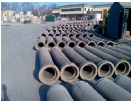
Figure 2: Coastal Pipeline Products produces pipe from 12 to 72 inch inside diameter. Here, recently "tipped out" 15-inch pipe is laid out in preparation for yarding.

"Pipe is a relatively small, but critical part of our business," says Raymond. The firm began life as a pipe producer—hence the com-