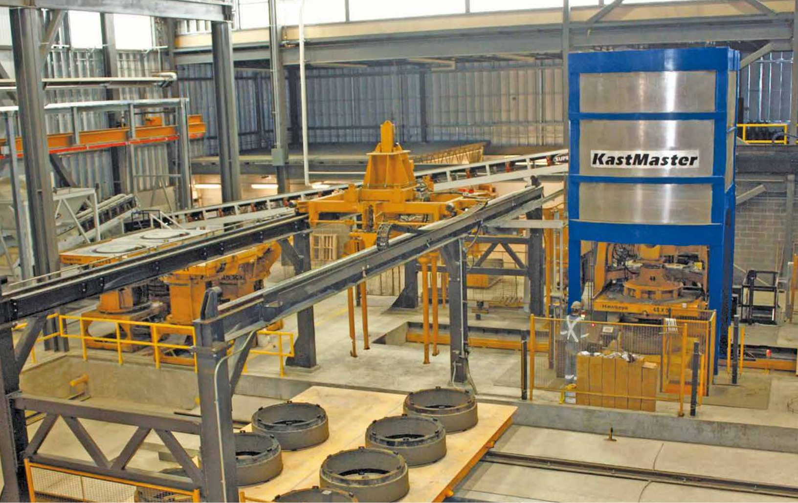
Demolding by Cart