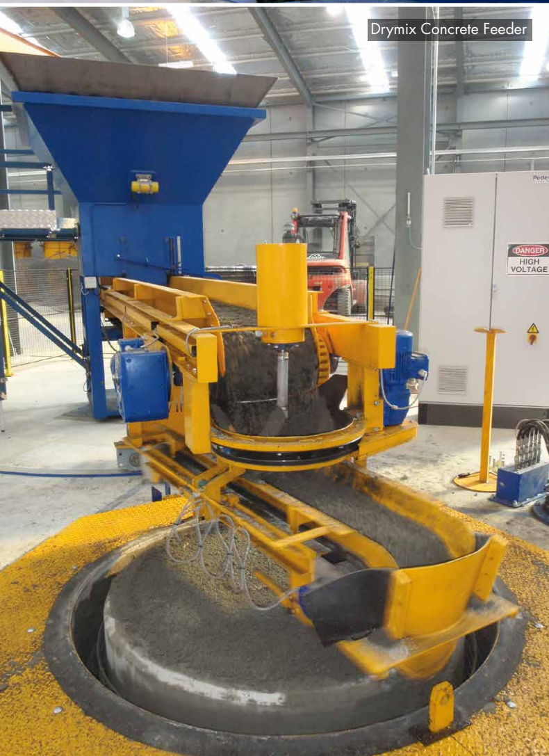
Drymix Concrete Feeder