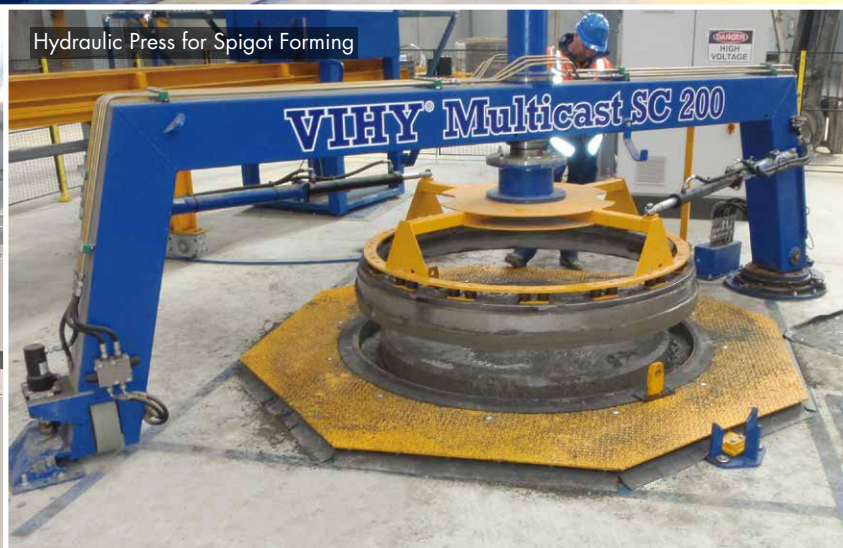
Hydraulic Press for Spigot Forming