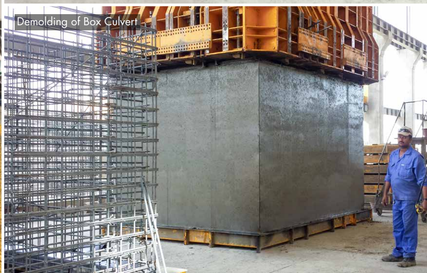
Demolding of Box Culvert