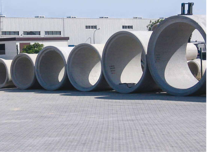
Products in Different Diameters