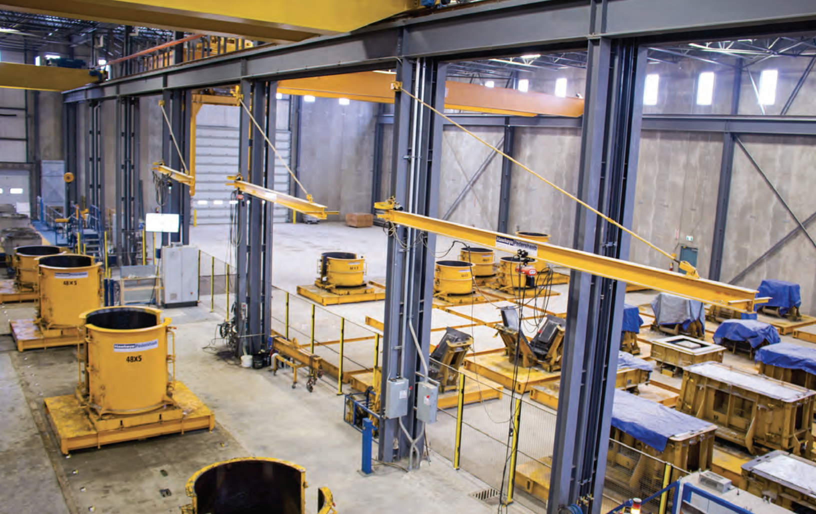
Assembly Line Work Stations