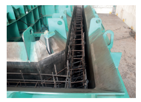
Modular rectangular pipe moulds offer absolute flexibility.