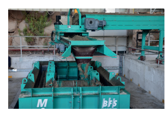
Mammut production with rotating discharge belt and CNC path control.

The parameters of the products to be manufactured are taken into account in the design of a vibrating table. The number of hydraulic clamps required for mould fixation, the precise dimensions of the table and the number and performance of the vibrators are calculated with the utmost accuracy. The electrically driven vibrators