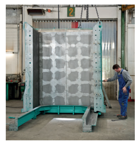
Assembly of precisely shaped modular mould parts.