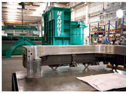
Finitec spigot-end mould for precise, clean joints