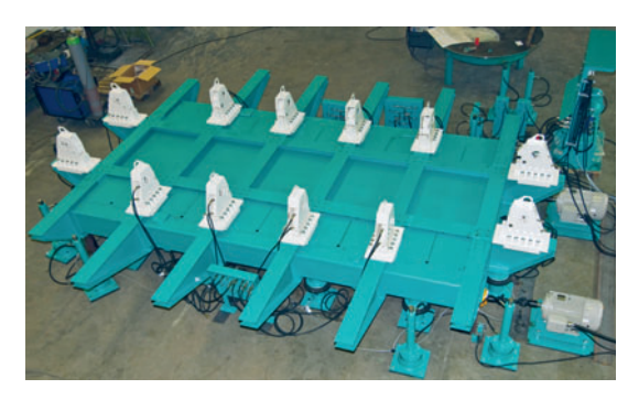
Example of a stable vibrating table

Based on the customer's requirements, either fixed or modular moulds are offered