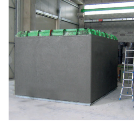
Box culverts after demoulding, with the Finitec spigot-end mould still in place.

manufacturing of every product. Whether rectangular pipes, U-profiles, pipes or manhole elements, each production cycle produces an optimum product.