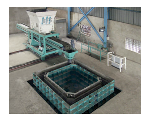
Mammut production with two-axis linear feeding.

A height adjustment unit is available for the vibrating table for the manufacture of products with different overall heights. A hydraulically synchronized demoulding aid