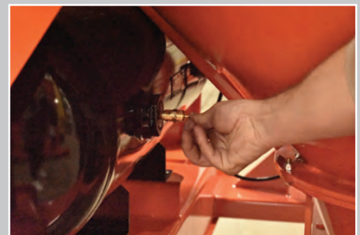
Pressure relief valve