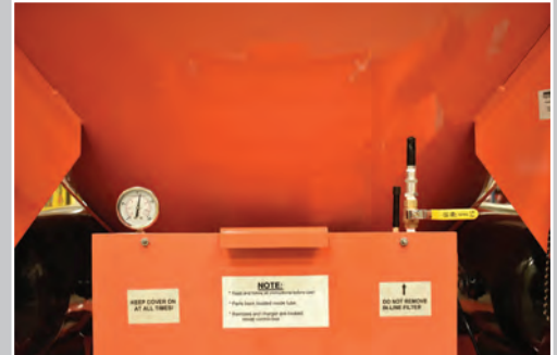
System Pressure Gauge & Quick fill coupler with ball valve shut off