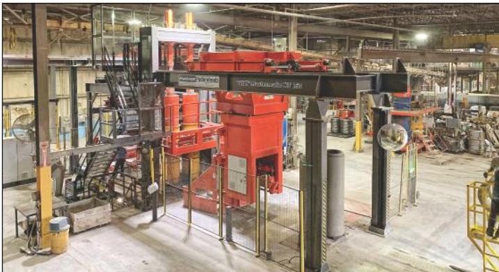
HawkeyePedershaab Mastermatic XT Machine

Fully automatic packerhead machine with four layers of rollers for optimum compaction.