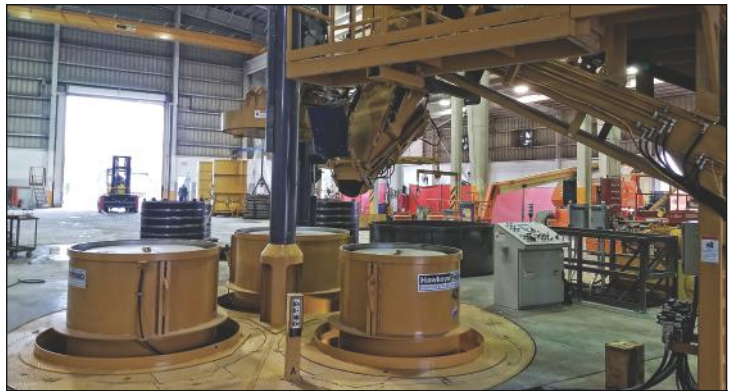
HawkeyePedershaab PipePlus Machine

Automated production using VIHY rising core technology for reinforced and non-reinforced pipe production.