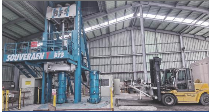
BFS Souveraan Packerhead Machine

Electronic direct-drive packerhead machine for mass production of concrete pipes with or without bell sockets.