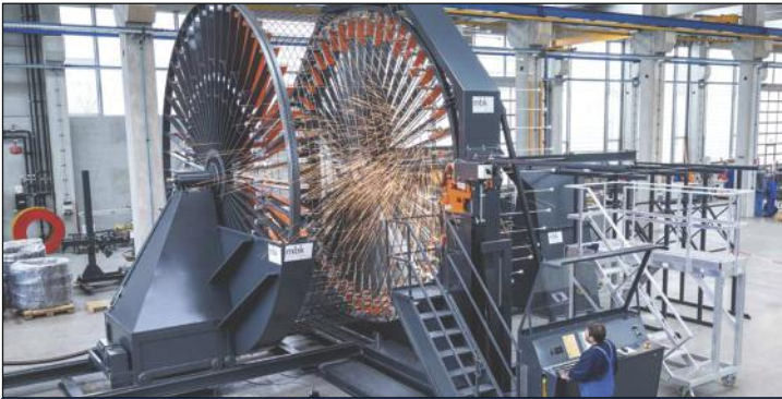
mbk BSM Cage Welding Machine

High output, automated solution for the production of reinforcement cages.