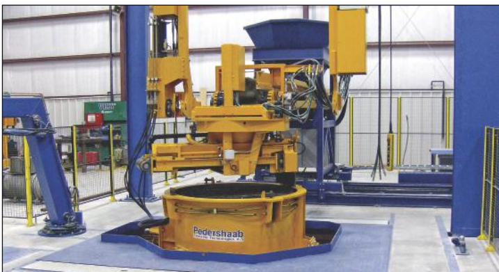
HawkeyePedershaab Multicast Machine

Three-station turntable that delivers versatility and high output. Its robust capabilities make it perfect for all producers.