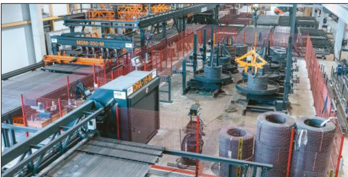
mbk Mesh Welding Machine