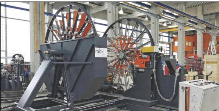
mbk ISM Cage Handling Machine

Cost-effective solution for increased production of reinforcement cages.