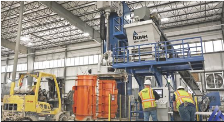
HawkeyePedershaab ePak Packerhead Machine

Electronic direct-drive packerhead machine for mass production of concrete pipes with or without bell sockets.