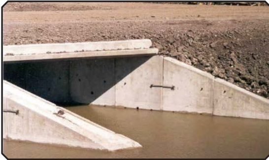
Box Culvert End Sections