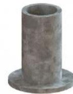
BELL END SPACER