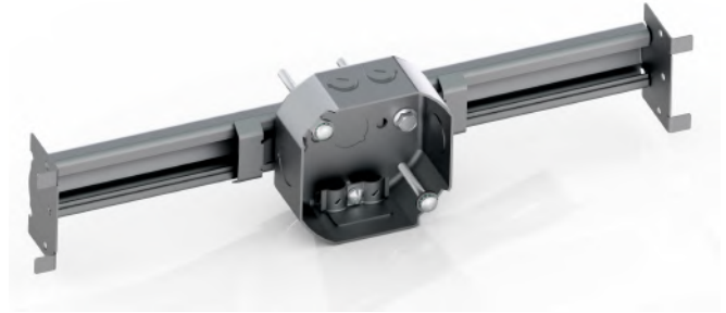
BH1002 with Tabs on Mounting Plates

Amifast “new work” bar hanger is a UL-Listed adjustable bar hanger for light fixture and fan support. The bar hanger has pre-installed adhesive tape on each end for easy installation to ceiling joists. BH1002 is identical to BH1001 except for the additional of tabs on the mounting plates for easy alignment to the joists. All necessary hardware is included with each unit. Sold in boxes of 24 pcs.