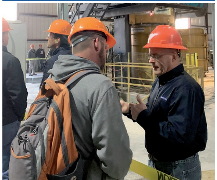
Plant Optimization Programs