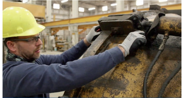
P-Lock assembly inspection

Contact the Afinitas Service Team for a quote.