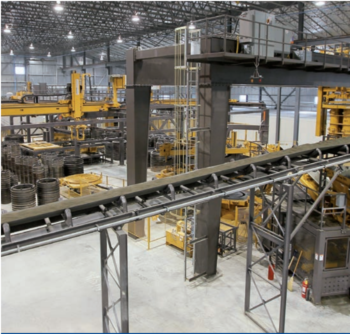
Automated pipe plant