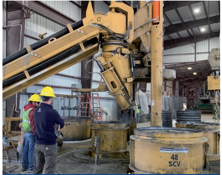
Machine Maintenance Programs