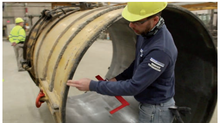
Jacket top inspection