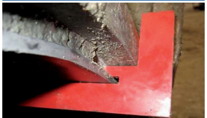
Jacket wear indicator