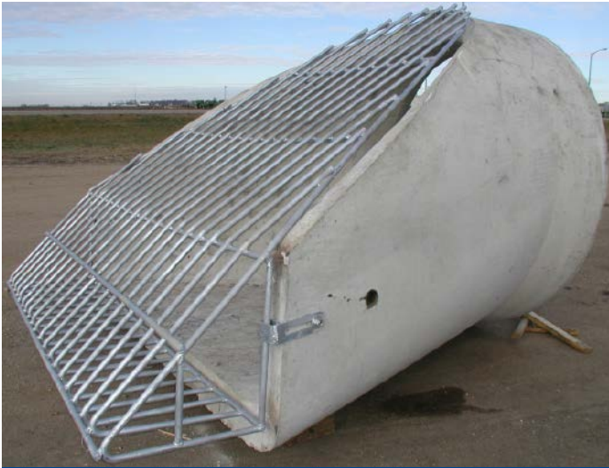
Bullnose Trash Guard