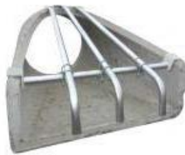
Flared End Vehicle Safety Grate