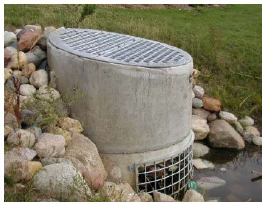
Pond Skimmer with Manhole Side Grate