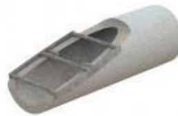
Ladder Safety Grates