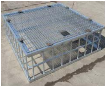
Custom Top Mounted Box Grate

Visit our website for more information on grates and guards.