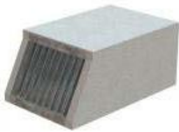
Beaver Buster Grates

Afinitas is the premier supplier of grates and guards with a vast portfolio of options. We have the capability to custom design and manufacture grates for your specific requirements, and each option is typically made from galvanized steel but can be made from other materials such as aluminum or stainless steel.