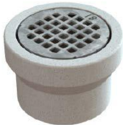
Outlet Screens & Bell End Grates