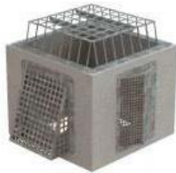
Box Inlet Grates