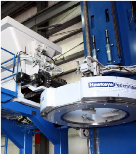
Equipment & Automation