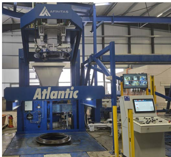
Machine Maintenance Programs