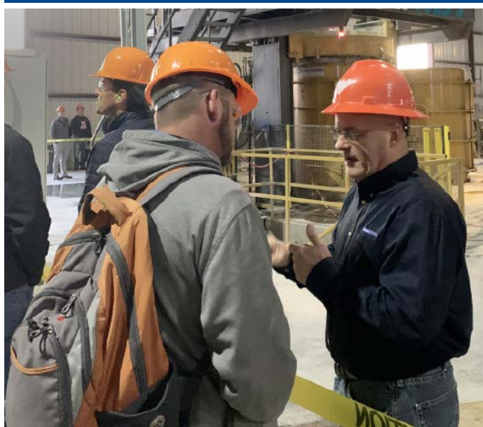
Education and Training